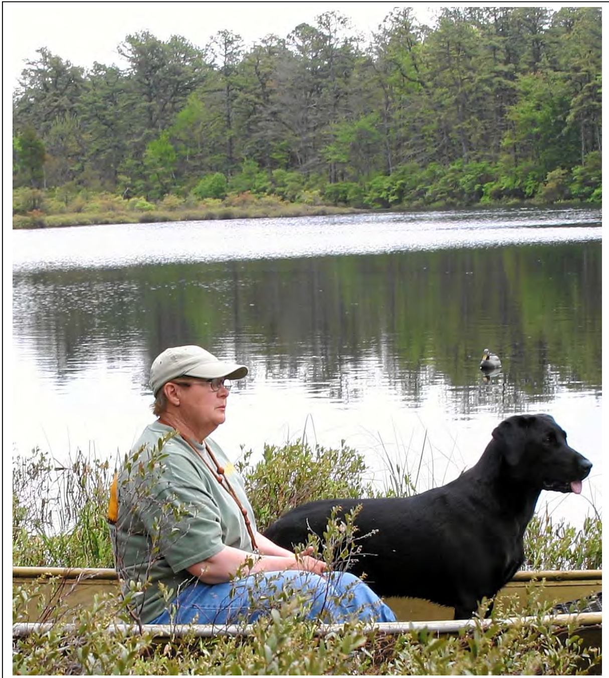
Conservation through the development of trained retrievers