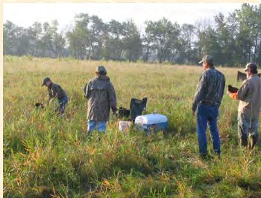
The Next Generation