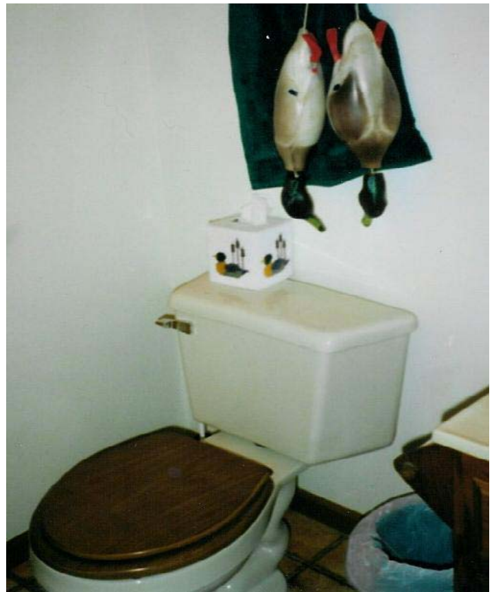
figure 1: The ideal "Sit-to-flush" test

range and the dog must check in on the handler so that he maintains that bond that makes them a team, not two separate entities charging down through a field for the "sit-to-flush." A charge to the flush with no hunt is a failure whether or not the dog is steady.