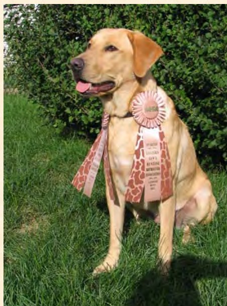
Brought home a couple ribbons