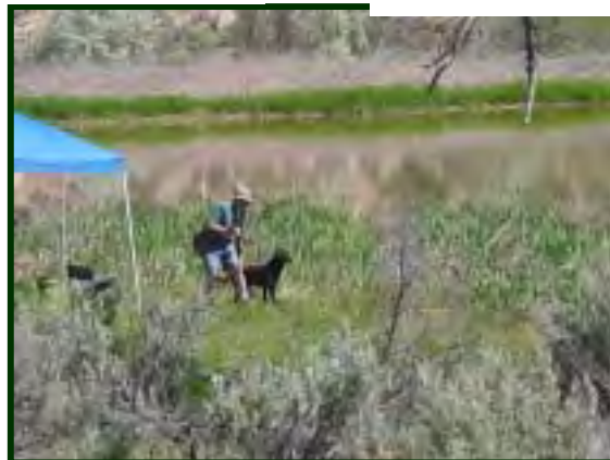
Fred Lysinger on the water series