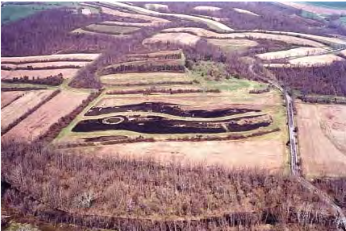
State Game Lands 169 is 2500 acres of waterfowl, upland bird and forested habitats. The Conodoguinet Creek bisects the area. The third picture shows pond complex 9.