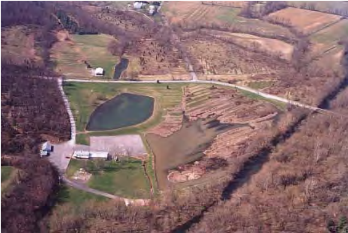
The second picture is also the BSF&G showing the whole complex. The pavilion in the middle left will house the ribbon ceremony and possible other activities. The clubhouse is located in the foreground.